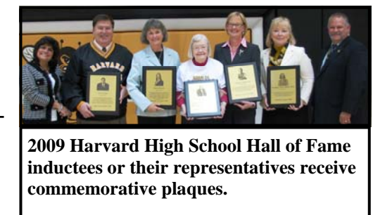
2009 Harvard High School Hall of Fame inductees or their representatives receive commemorative plaques.